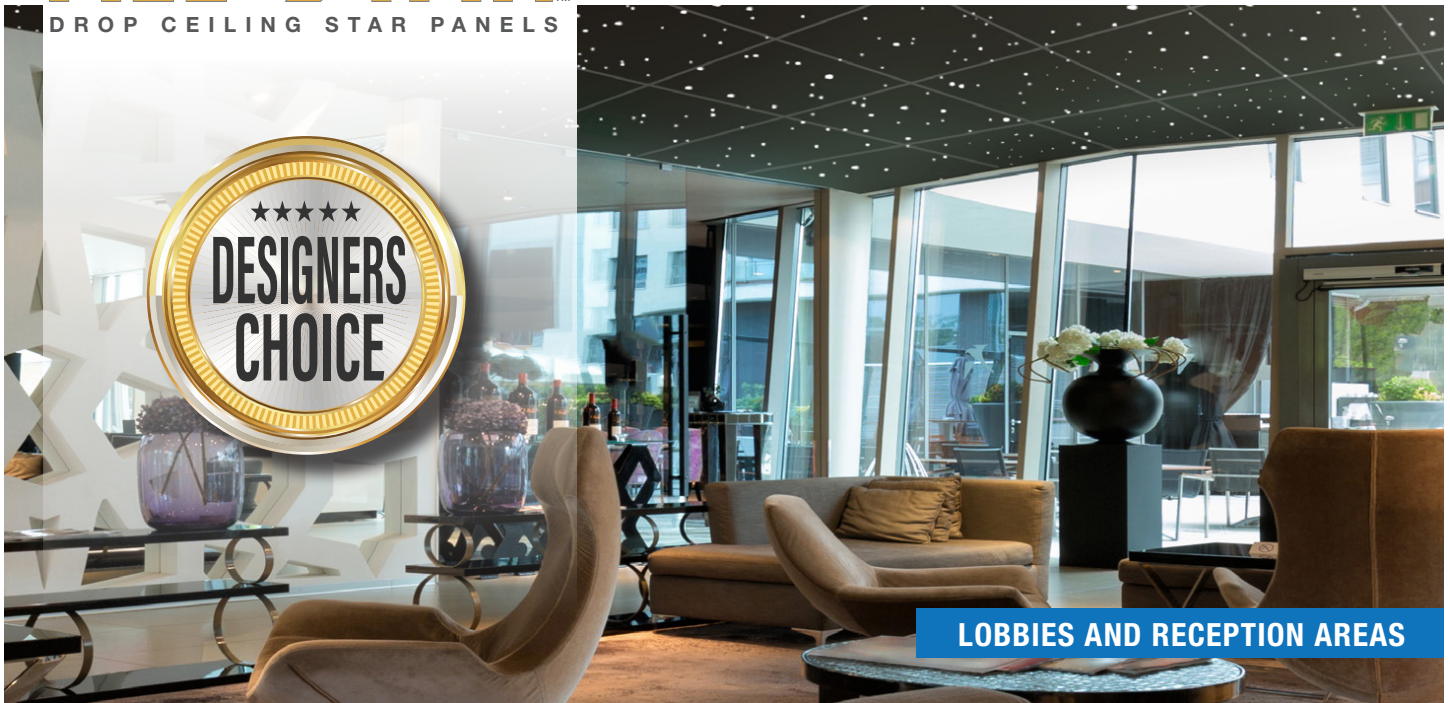
LOBBIES AND RECEPTION AREAS